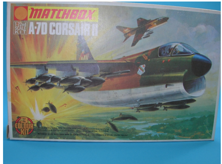
Matchbox 1/72 A-7D Corsair II

This kit has two sizes of bombs and Sidewinder missiles that fit onto the fuselage and wing stores pylons (raised panel lines). While the